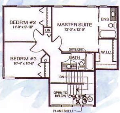
SECOND FLOOR PLAN 738 SQ. FT. (68.6 M 2 )